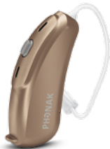
Amber Beige (P2)