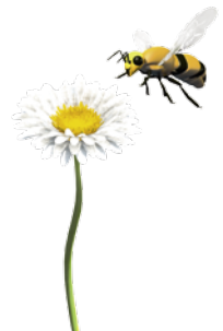
Phonak CROS II-13