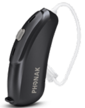
Velvet Black (P8)