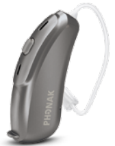
Graphite Gray (P7)