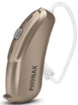
Sand Beige (P1)

Choose from 11 colors to either match your skin tone or hair color.