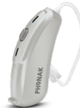
Silver Gray (P6)